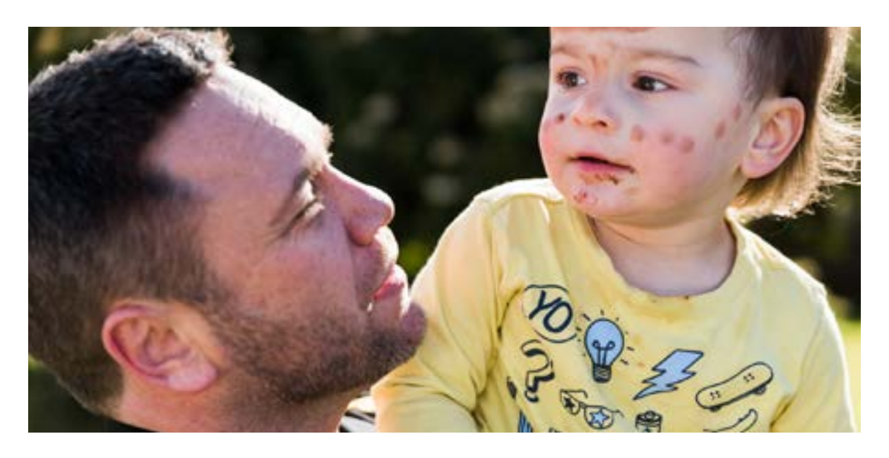
The VAAF's relationship with existing strategies