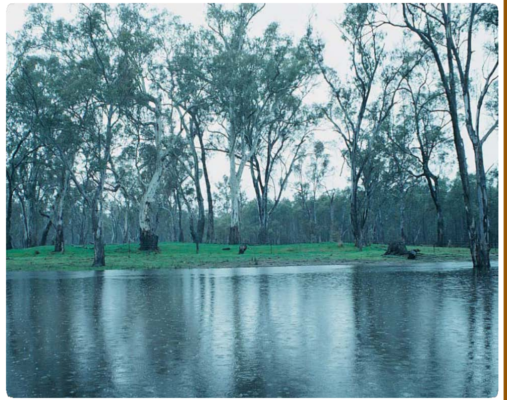
Mound on flood plain