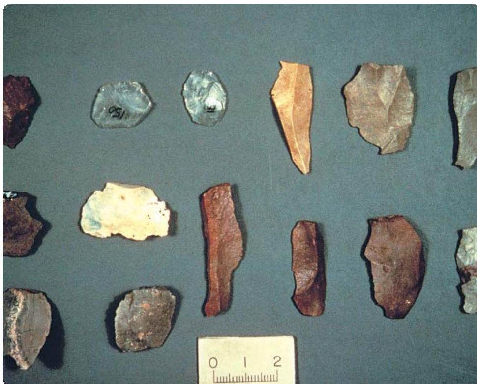
A group of artefacts of different size, shape and material