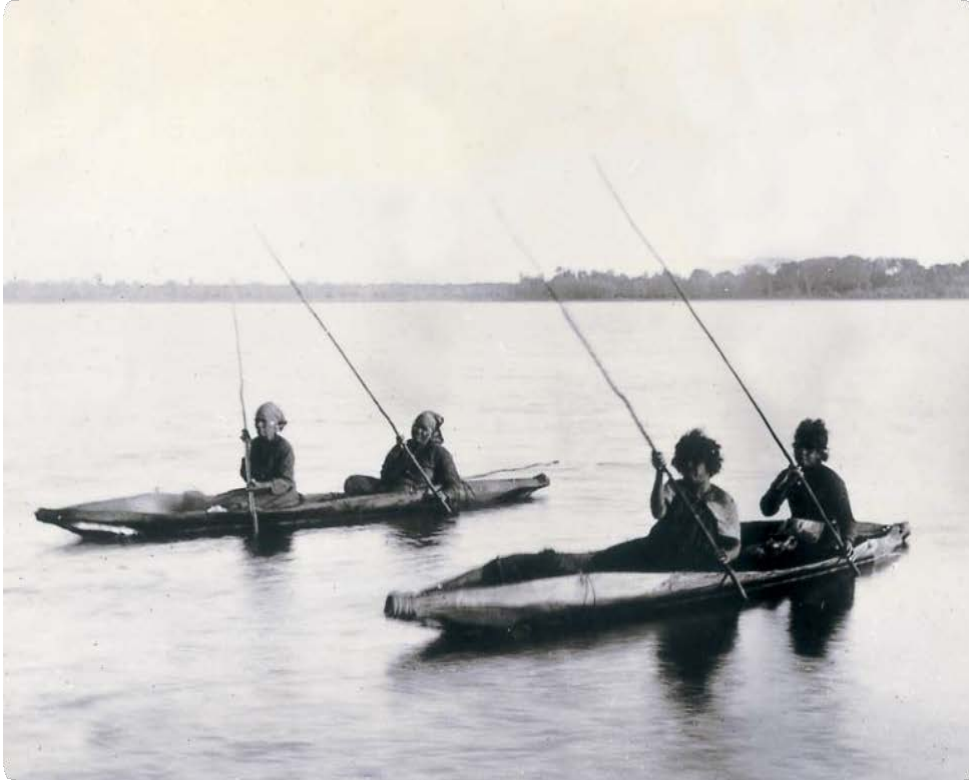
Aboriginal people in canoes on Lake Tyers 1886